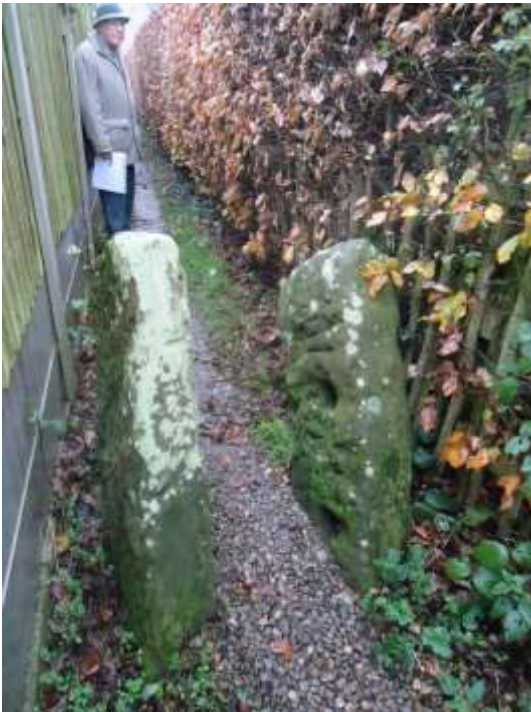
1. CFP22 Skips Lane