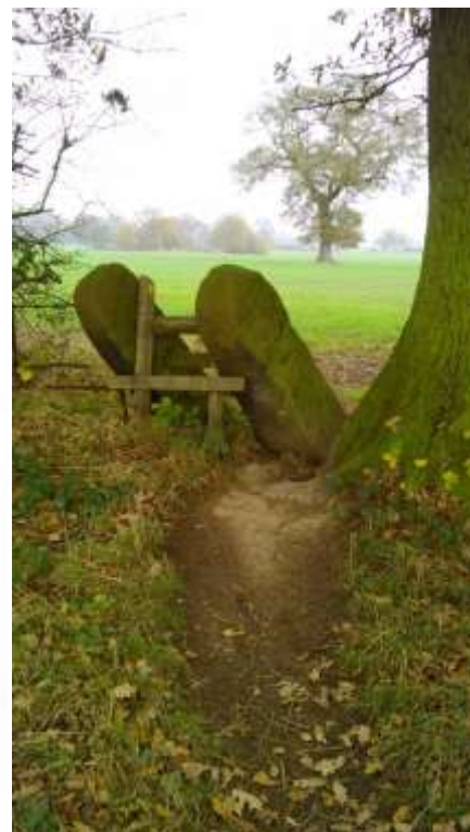
4. FP3 en-route to FP9.

Please provide any historical evidence or reference data: