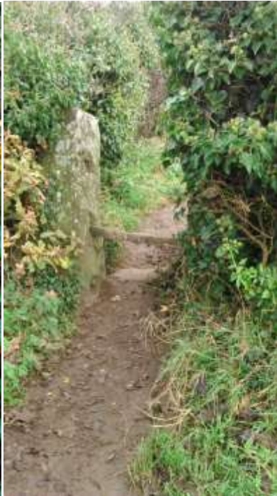
2. CFP13 nr Birch Heath Lane